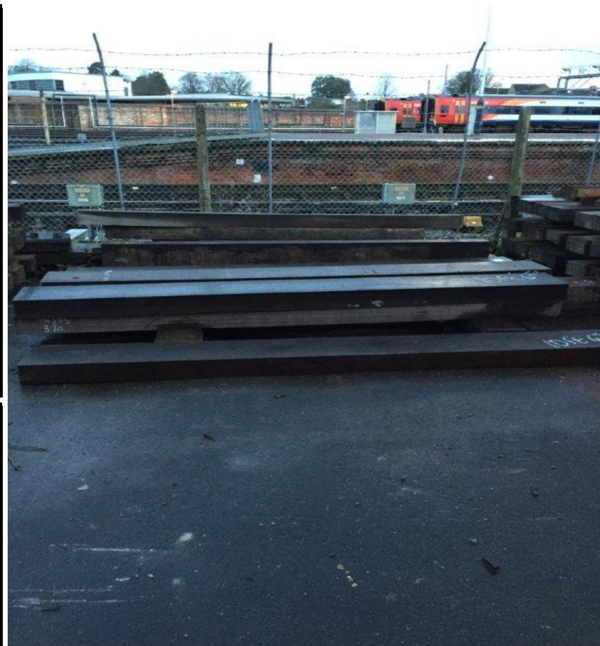
Stored sleepers and timbers in Salisbury Yard Picture taken of the positioning of the staff involved in the incident

Positioning of flat bed in relation to stock pile. →