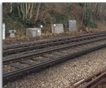
Here is an example of inventory safely banded and stacked away from the railway

Lesson Learned...all contractors are encouraged to make sure all inventory connected with the delivery of projects for IP that are left lineside are clearly marked with the Principal Contractors name, the project number, and a name and contact telephone number.