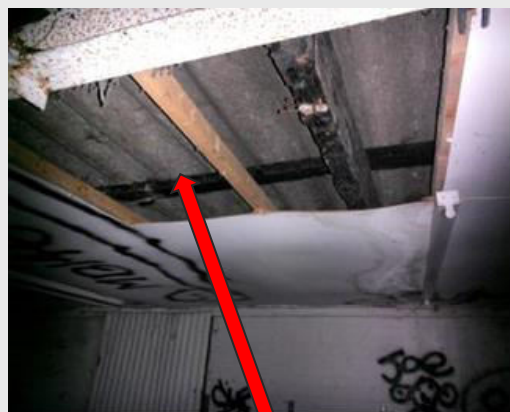
Underside of Roof Sheets