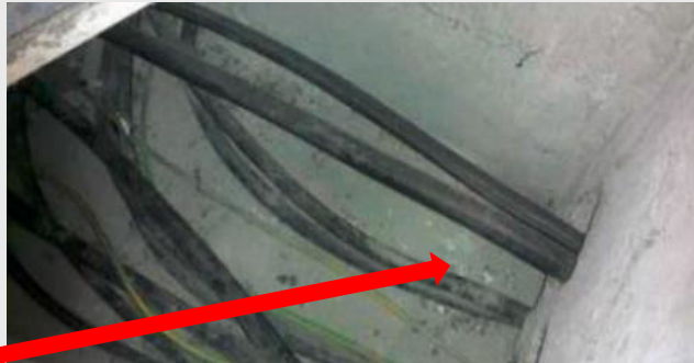
Debris within ducts