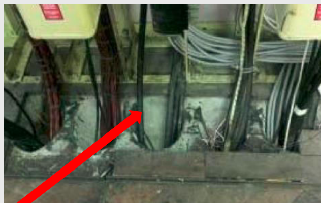
Paper insulation / cable sleeve