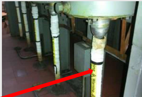
Cable wrap / bitumen