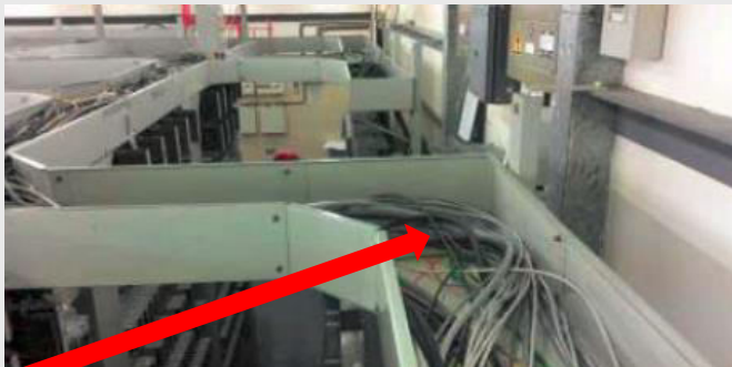
Debris within cable trays