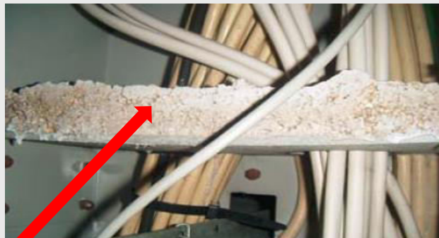
Insulating board with non-asbestos sprayed coating